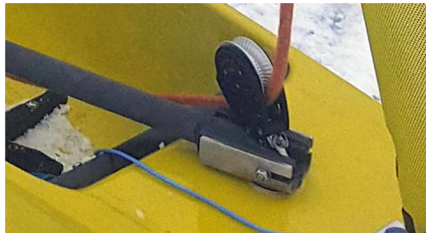
Question 4: New I. Fittings 18. Steering Post Head